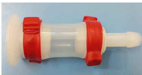
Connection covered with oetiker and tie guard